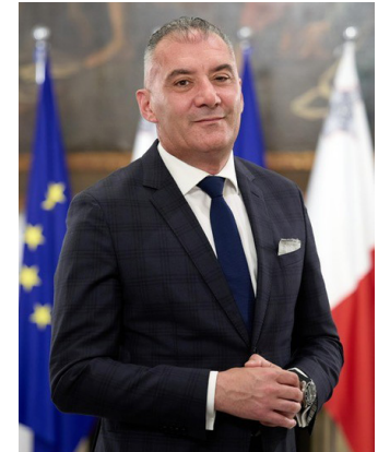
Hon. Jo Etienne Abela

“We are committed to excellence; to the highest possible level and quality of integrated primary health care service delivery, while we continue to explore new avenues to increase patients’ accessibility further in the community.”